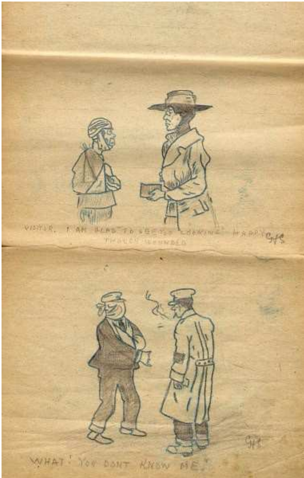
Above: Visitor: I'm glad to see you looking happy though wounded!