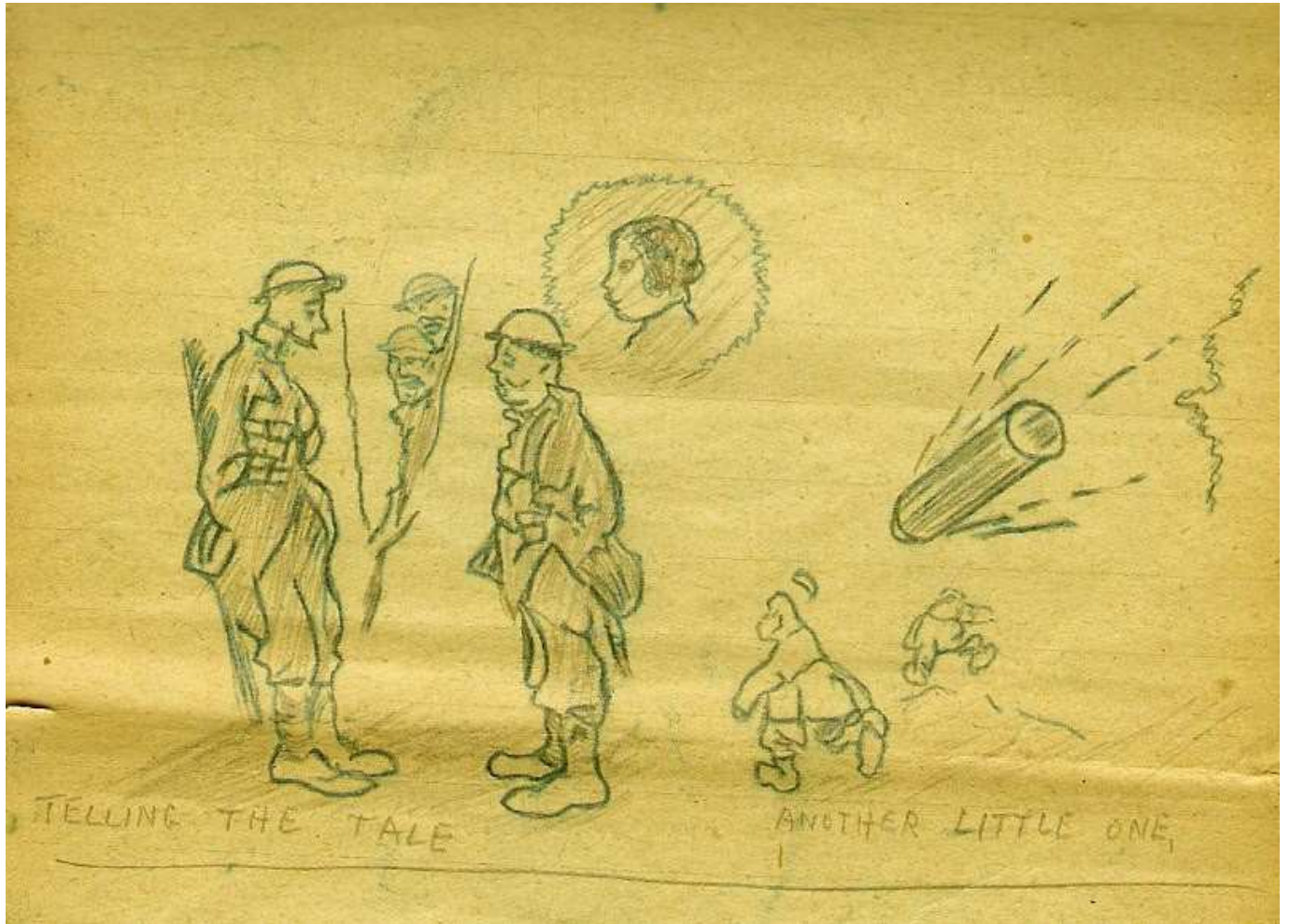
Telling the tale - Another little one!