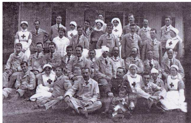
Above: Patients and staff at Hale End/Brookfields Hospital