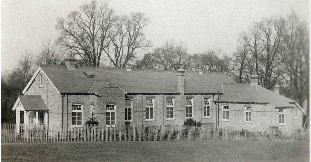
Above: The Red Cross Hale End/Brookfield Hospital at Oak Hill.