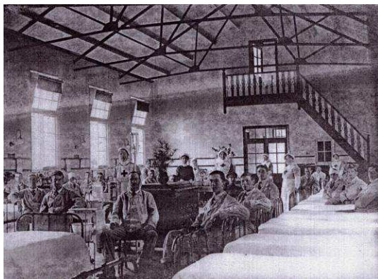
Above: The interior of Hale End /Brookfield Hospital

The Hospital, which also became known as the Brookfield Red Cross Hospital, had 30 beds. It was equipped and maintained by the Hale End District Association, which had been founded as a ratepayers' association in 1909. The Hospital was administered by a management committee according to the rules of the Red Cross Society.