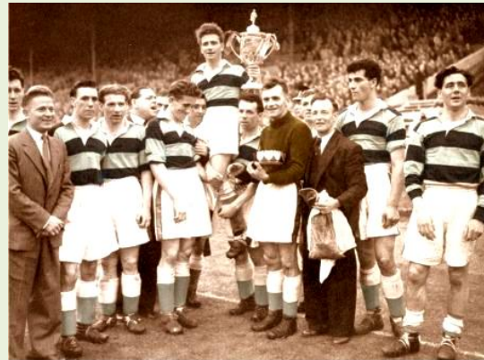
WALTHAMSTOW AVENUE (1951-1952 Amateur Cup winners)