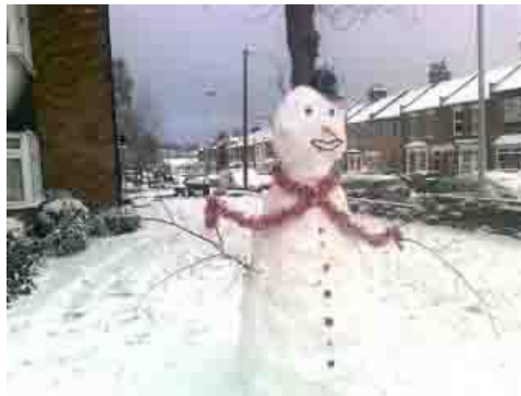
Snowman in Vallentin Rd., Walthamstow - 2010

Dear 'Walthamstow Memories' visitor/contributor,