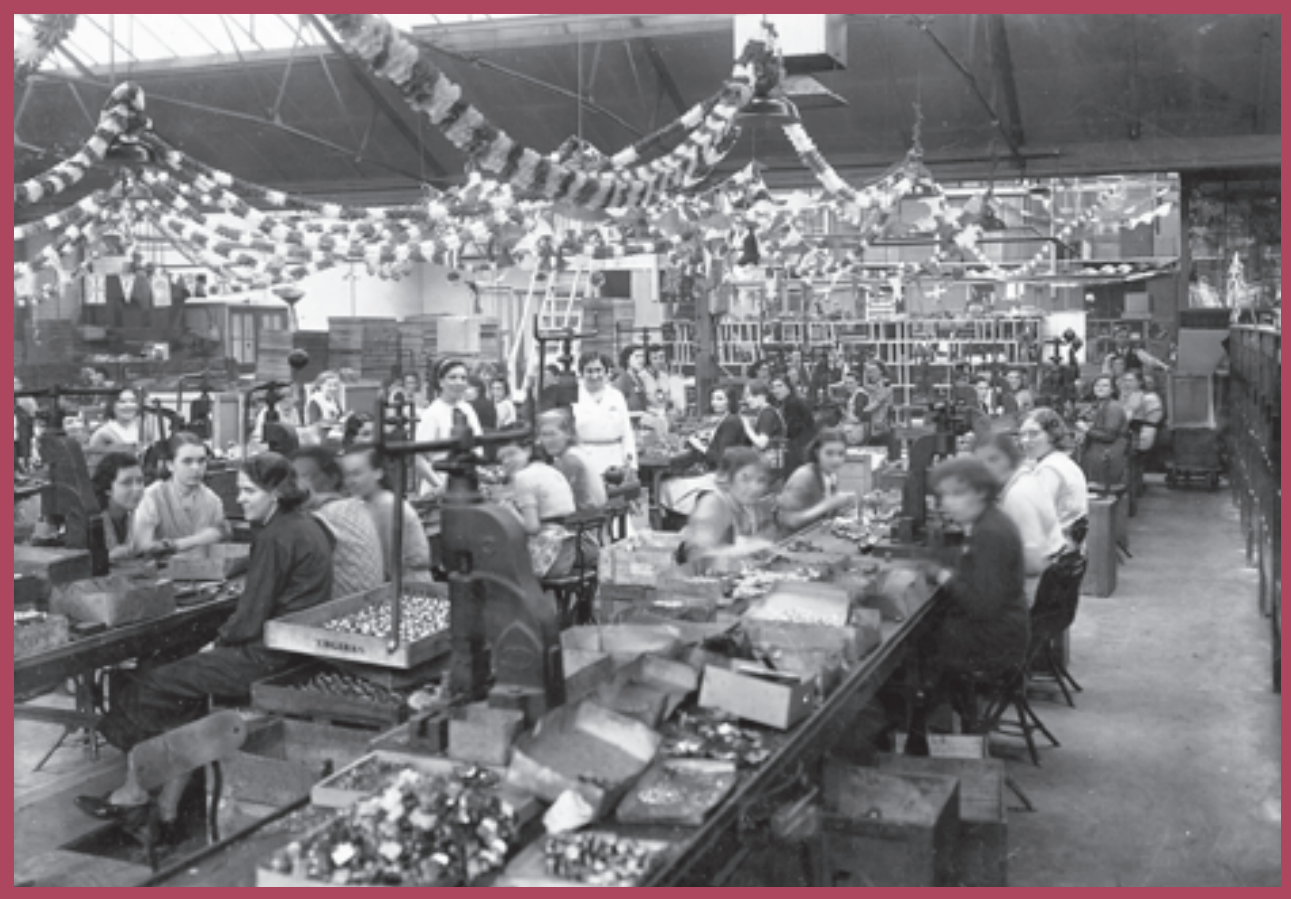
Wells Brimtoy factory decorated for the jubilee

Saturday 19 October 2013 – Sunday 23 February 2014