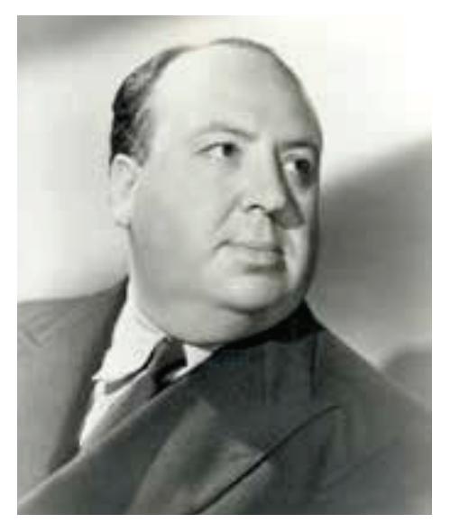
Alfred Hitchcock was born in Leytonstone

All proceeds go to supporting the Walthamstow International Film Festival